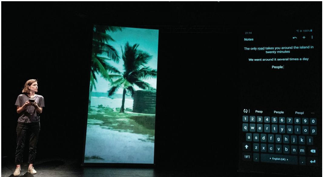
Hannes Dereere and Silke Huysmans, Pleasant Island , 2019. Performance.