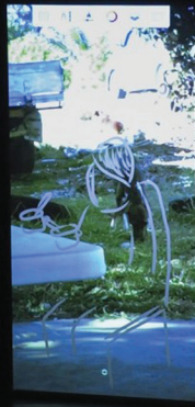
Hannes Dereere and Silke Huysmans, Pleasant Island , 2019. Performance.